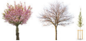
TRIMMING & LIMBING