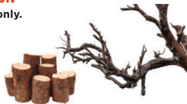
MEDIUM LIMBING & SECTIONING