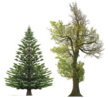
LARGE TREE FELLING