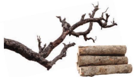
LARGE LIMBING & SECTIONING